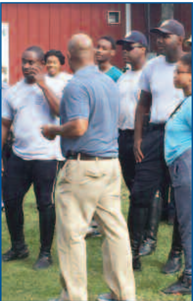
New APD Mounted Patrol mentoring program launched this summer with Atlanta Habitat Youth.

At-PROMISE is a win for the teens and their Habitat families as participation in the program contributes to their household’s required sweat-equity hours for an Atlanta Habitat home. The partnership aligns with our mission to be part of creating strong, safe communities as mentees built a rapport with the police officers and began to understand how they are part of the community. Atlanta Habitat joins the Boys and Girls Club and CHRIS 180 as partners with the Atlanta Police Foundation’s mentoring program.