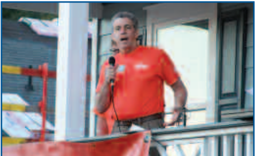
Craig Menear, President and CEO of The Home Depot, greets Team Depot.